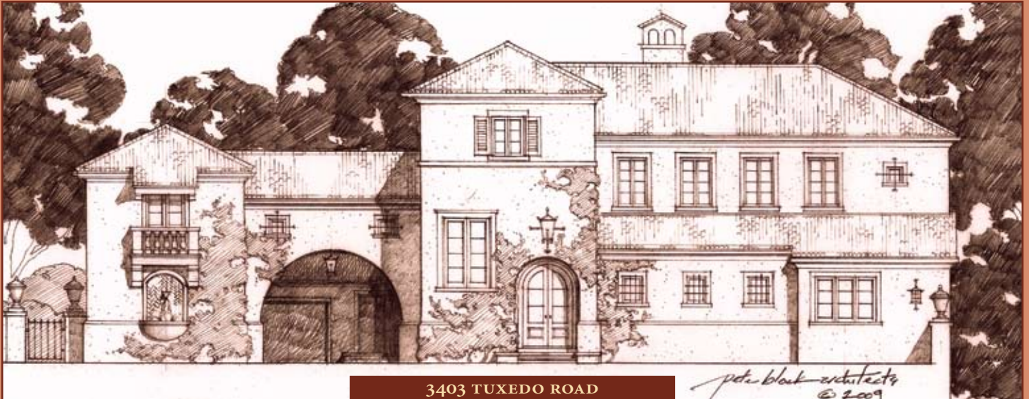
3403 TUXEDO ROAD

YM DERAZI & PETER BLOCK: HONORED RECIPIENTS OF THE 2011 PHILLIP SHUTZE AWARD